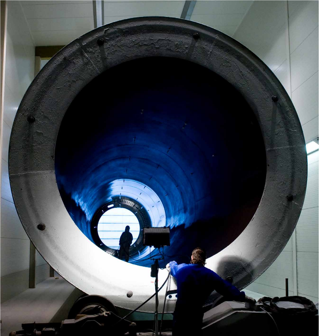
Coating work on a wind turbine tower