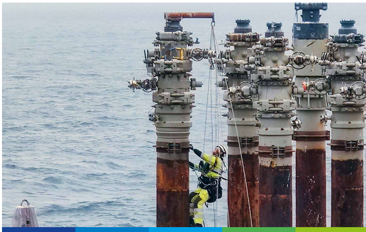
Offshore surface protection work